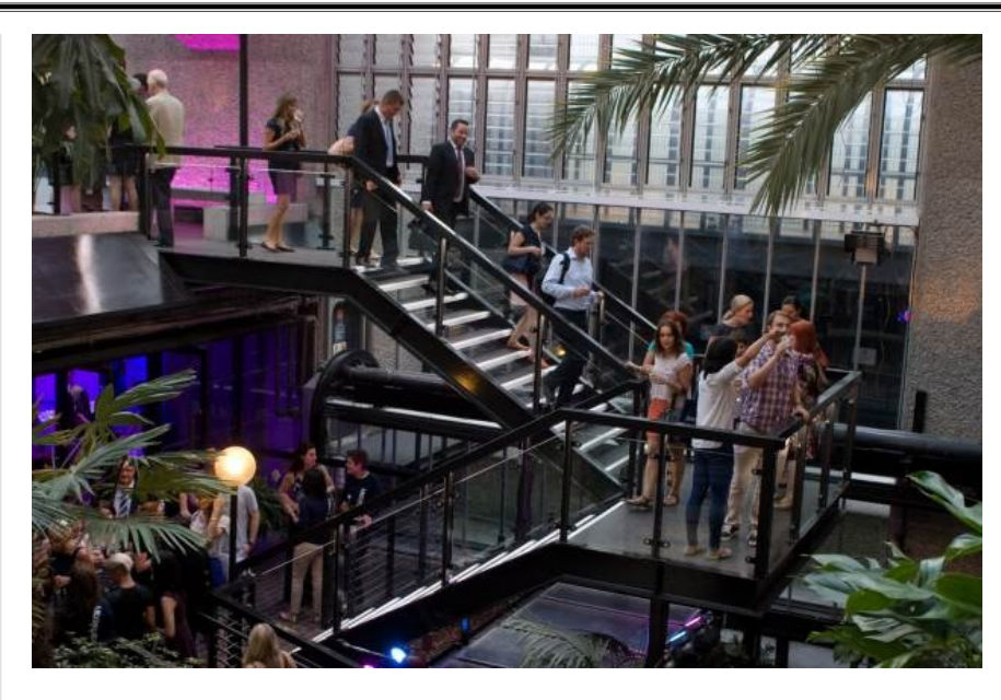
Back in the Conservatory, we tucked into bowl food: roast beef with creamy mash and gravy, and sea bass with creamed leeks and potatoes. The drinks continued to flow – we really enjoyed a glass or two of the elderflower fizz.