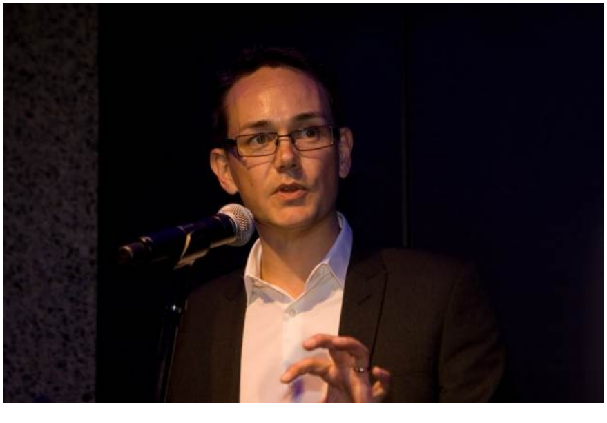
Once the congratulating was over, the Garden Room's doors opened to reveal a new staircase, which now interconnects the Garden Room to the Terrace above. Guests were clearly enjoying wandering along the upper levels.